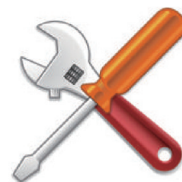
The escape of oil during installation and maintenance works