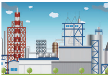
Factory oil waste