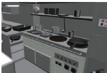
Kitchen Grease traps at restaurants